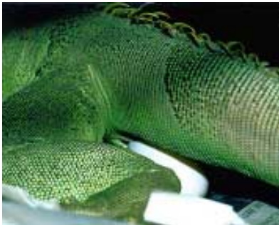
Egg laying female. They didn't like the egg laying site we prepared (Sand box). They just laid all over the room.

On 19th of May, one of them hatched. We guess this is the first regular succession report of iguana reproduction in Japan. The hatchling named