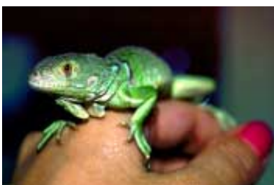
First egg hatched. They don't have any fear to human from birth.

"Bingo", had SVL of 77mm, tail length 220mm, weighted 15 grams. It was a lot bigger than we were thinking. We couldn't believe she was in her 35mm by 24mm oval shell. She must be tangled up in there. Although she was energetic, she had right eye problem. She can open only half of her right eye eyelid.