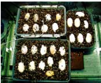
Eggs were incubated in a self-made incubator. Environment was kept in a 29 deg. temperature.