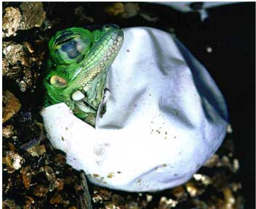
Hatching iguana : After 3 months' of patience, we got our special gift. This baby took 4 hours to come out.