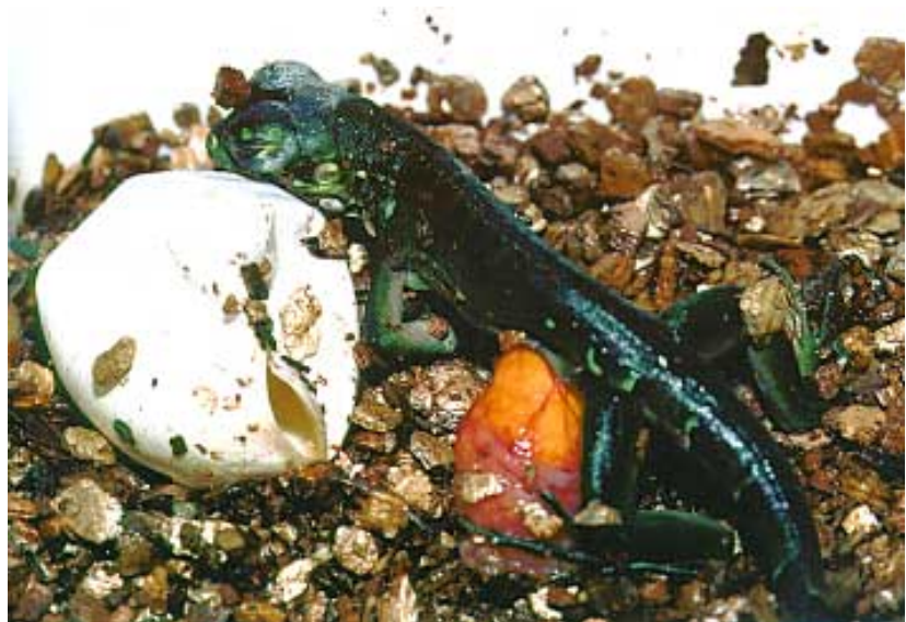
"Eve" came out with her huge yolk sack. She was completely premature and seemed not to survive. This yolk sack dropped off next day.