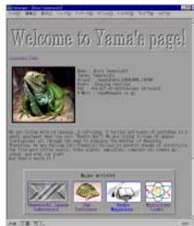
Yamanouchi Iguana Laboratory's Home Page. You can see our latest report from Japan. Mostly written in Japanese but some pages are in English. Of course photographs are international! Please visit us.

Most frequently asked questions are about their food. Most people, including shop owners and veterinarians, believes that iguanas are carnivorous when youth and changes to herbivorous when they grow up. We had a hard time explaining that they are herbivorous all through their life time. Many keepers are giving dog foods or cat foods. We had to stop them immediately.